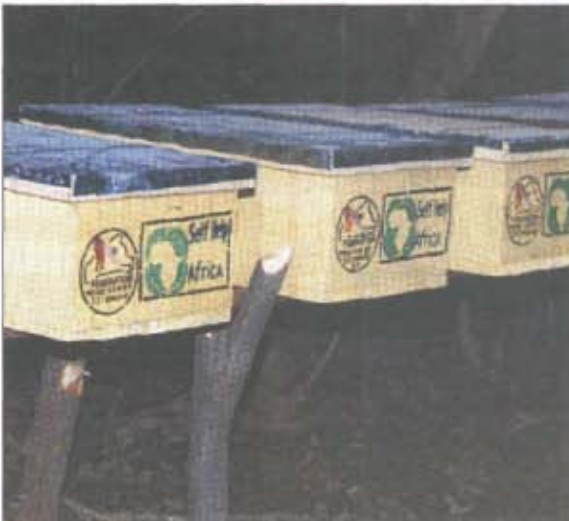
■ SELF HELP: Above, mothers and children shade themselves from the sun in Sika village, Burkina Faso. Left, the beehives kept by villagers in Lelexe, Burkina Faso. The honey producers in the village are members of Wend Yam Beekeeping Federation. Right, restoring fertility to the land in Sika village is a slow, tedious and backbreaking job