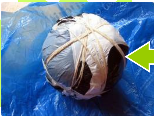
Your plastic bag football is finished! Why don't you use it to play a game?