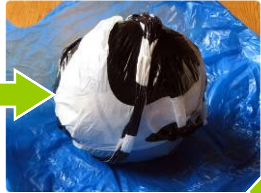
Save a good strong plastic bag for your last one.