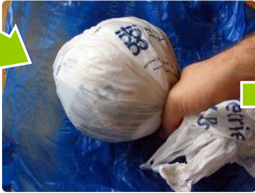
Keep placing the ball in more bags, twisting, turning and tying.