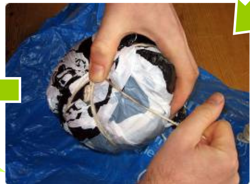
Tie the string and wrap it tightly round the bag in one direction and then at different angles.

There are lots of different ways to make plastic bag footballs and some African children make up different designs. These sheets tell you how to make a simple version.